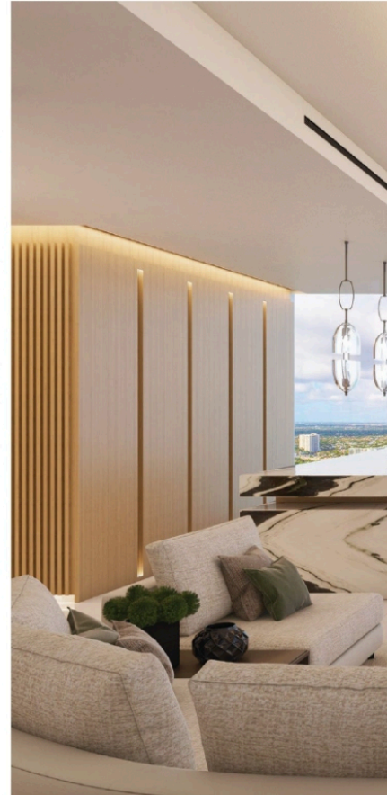
Left, from top: Hallock Design Group's contemporary living space; B+G Design reflects the outdoors in its design.